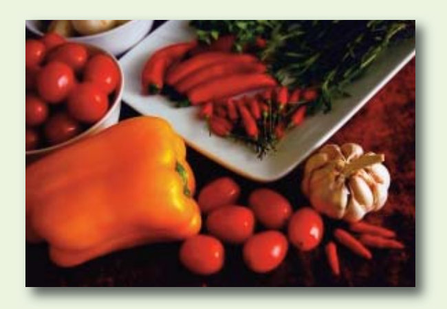
Advances in the Food Program