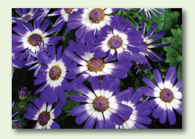
Advances in Ornamental Horticulture