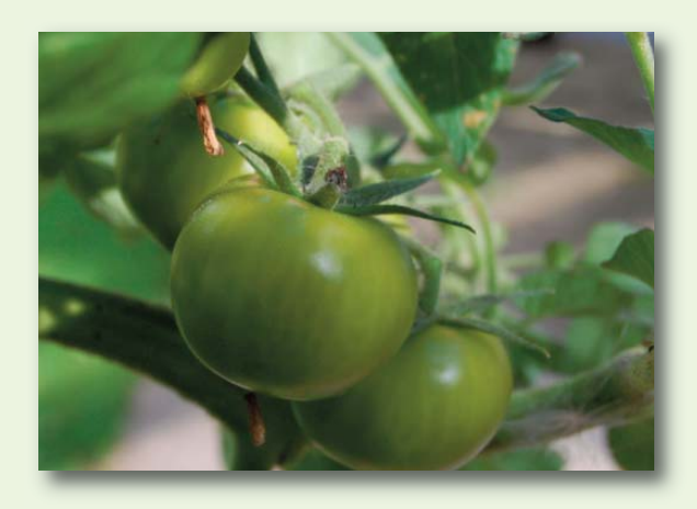
Advances in Biopesticides & Organic Support