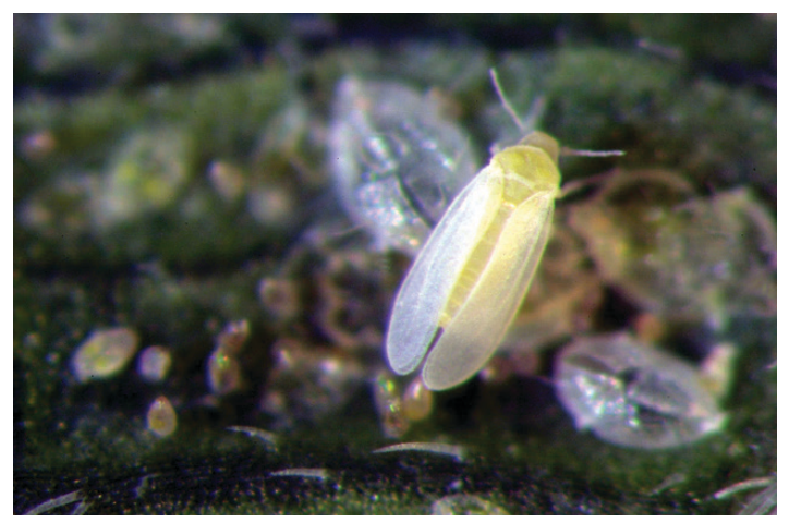
Figure 3. Whitefly, Bemisia tabaci Gennadius, adult.