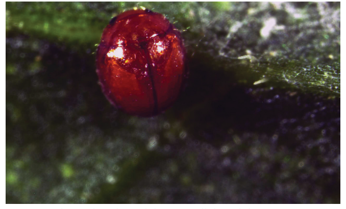
Figure 4. Predatory beetle, Delphastus pallidus adult.

Several biological agents are available for managing B . tabaci including predators (the mite Amblyseius swirskii, or the insects Delphastus catalinae, lacewing larvae), parasitoids (Eretmocerus eremicus, Encarsia spp.) or entomopathogenic fungi (Beauveria bassiana, Isaria fumosorosea). Before applying any biocontrol agents (BCA), it is important to check with commercial vendors of BCA for their compatibility with chemicals and environmental requirements such as temperature, humidity, and day length. BCAs may not control an existing high population of whiteflies before significant crop damage occurs, so early application of agents before high pest buildup is recommended. Use of generalist predators can provide control of B. tabaci along with other pests of ornamentals. In Florida, B. tabaci is effectively managed on ornamentals and vegetables grown in greenhouses with Encarsia transvena. In our recent greenhouse studies focused on integrated management of MED on salvia and mint crops, we observed the predatory mite A. swirskii and parasitic wasp E. eremicus to be very efficient in managing this pest, respectively. Consult with your local UF/IFAS Extension specialist about the suitable biocontrol agents available for a specific crop.