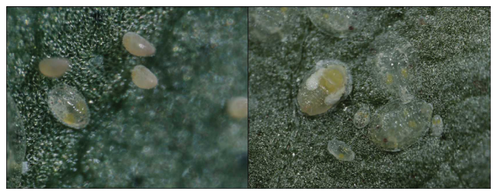
Figure 2. Whitefly, Bemisia tabaci Gennadius, immature stages. Credits: Lance S. Osborne, UF/IFAS