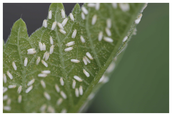
Figure 1. Whitefly, Bemisia tabaci Gennadius, eggs and adults.

manage and maintain whitefly populations throughout the initial propagation and active growth stages at levels that will minimize numbers on the final plant material being shipped. This will also minimize selection for insecticide resistance irrespective of whitefly biotype while helping to achieve top-quality plant materials. Growers should apply pesticides when scouting reports identify population densities at levels where experience and/or Extension personnel indicate action should be taken. These densities would depend on many factors including the crop, source(s) of infestation, and environmental conditions.