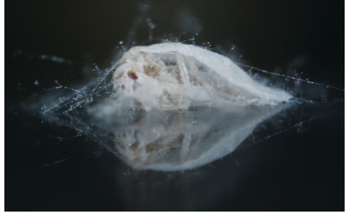
Figure 6. Whitefly adult affected by entomopathogenic fungi B. bassiana .