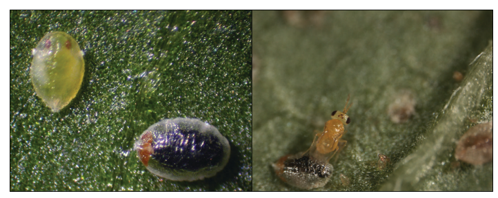
Figure 5. Parasitic wasp, Encarsia sophia parasitized B. tabaci (on left), parasitoid emerging (on right).