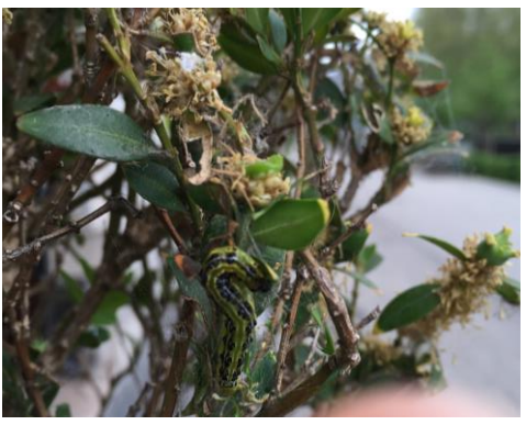
Late-instar box tree moth caterpillar with webbing.