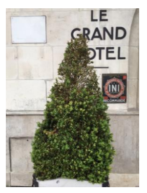
Box tree moth damage.

Many insecticides (Table 1) are labeled for control of caterpillars. Some broad-spectrum materials, such as some pyrethroids and carbaryl, may flare spider mites or other pests. Note label cautions concerning environmental and non-target risks.