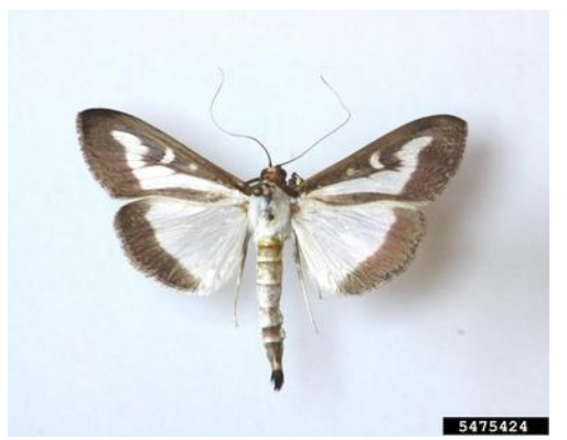
Box tree moth, white morph.

Box tree moth has a 4-cm wingspread with white or brown color morphs. Only the white form (white wings with brown borders), is found in North America. A brown form, also found in Europe, is almost entirely dark brown with characteristic white specks on the forewings. Caterpillars are yellow to lime green with dark stripes and a black head, reaching 2 cm before pupation. Among very few caterpillars able to feed on boxwood, they consume leaves and bark and can quickly defoliate and even kill large hedges. Their unsightly webbing and frass help protect from predators, reduce spray coverage, and insecticide efficacy.